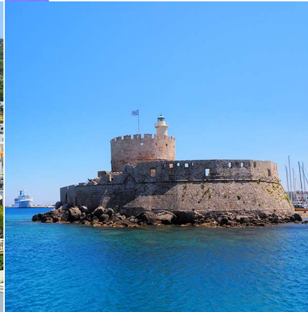
Bodrum | South Greece | Bodrum

Bodrum » Kos » Nisyros » Tilos » Rhodes » Symi » Knidos » Bodrum View Details