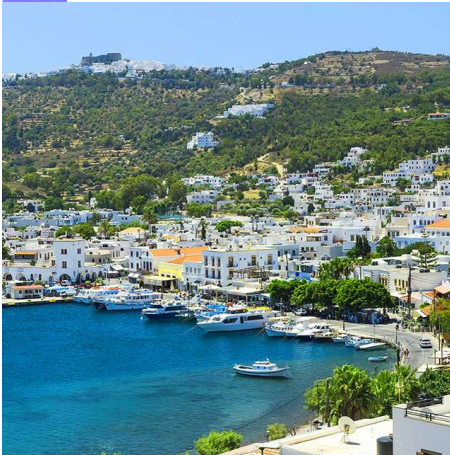
Bodrum | Patmos | Bodrum

Bodrum » Kos » Leros » Patmos » Kalymnos » Kos » Bodrum Marina View Details