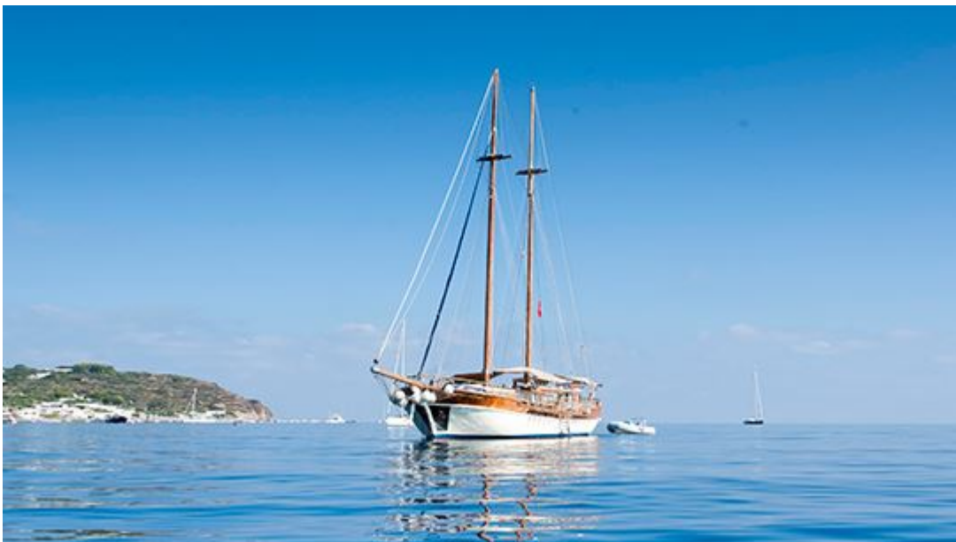
Aeolian Islands Itinerary