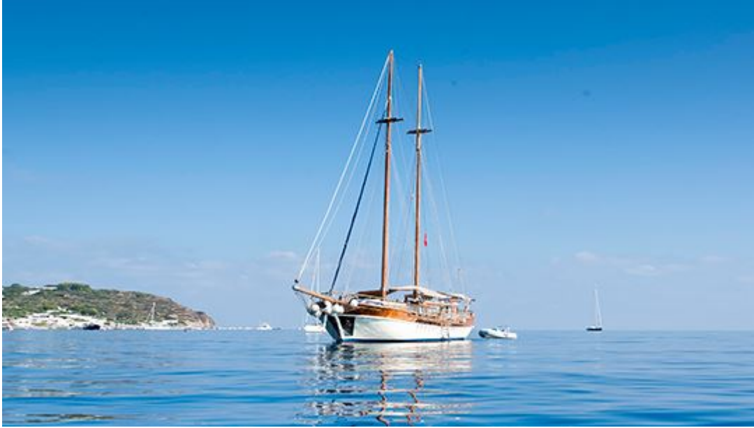
Aeolian Islands Itinerary

Sailing to Lipari and visit through dinghy between the “Faraglioni”. In the late morning, the client could swim in the suggestive turquoise waters. During the evening mooring in front of the old harbor of Lipari “Marina Corta”, afterward landing ashore for shopping.